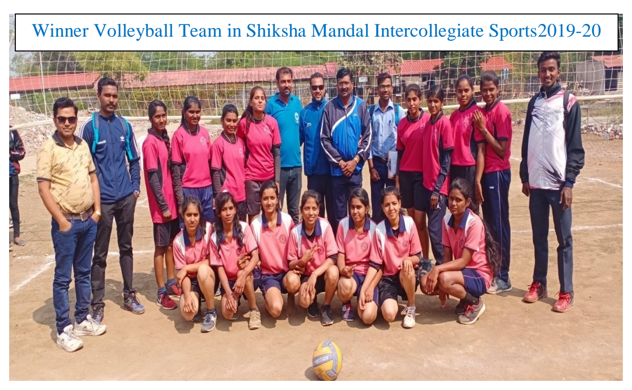
Figure 3Winner Volleyball Team in Shiksha Mandal Intercollegiate Sports2019-20