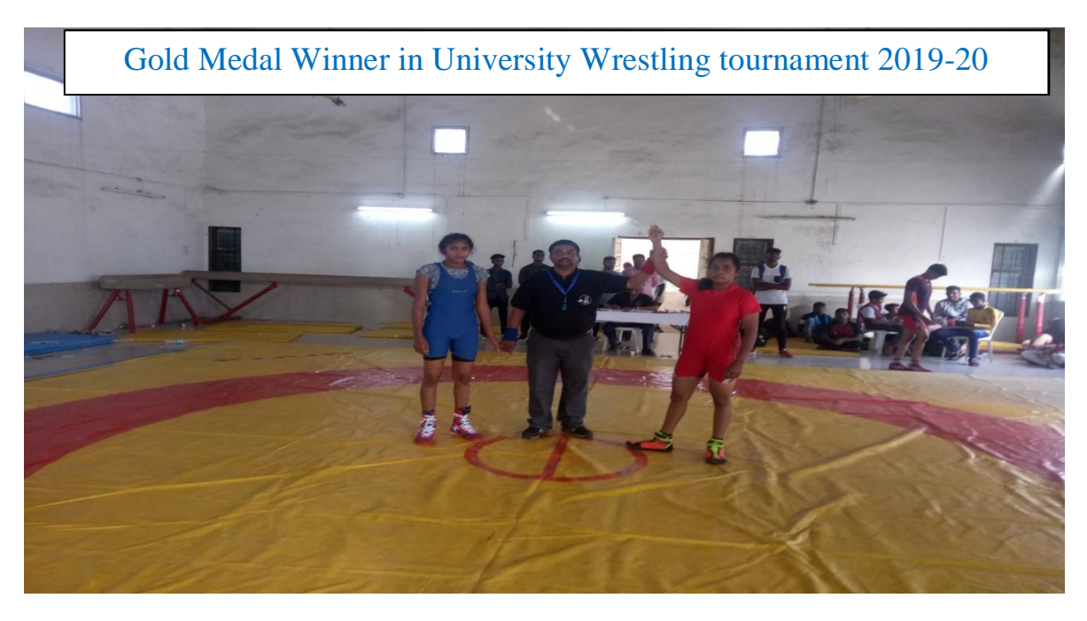
Figure 1Gold Medal Winner in University Wrestling tournament 2019-20