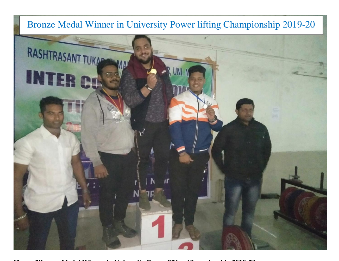
Figure 2Bronze Medal Winner in University Power lifting Championship 2019-20