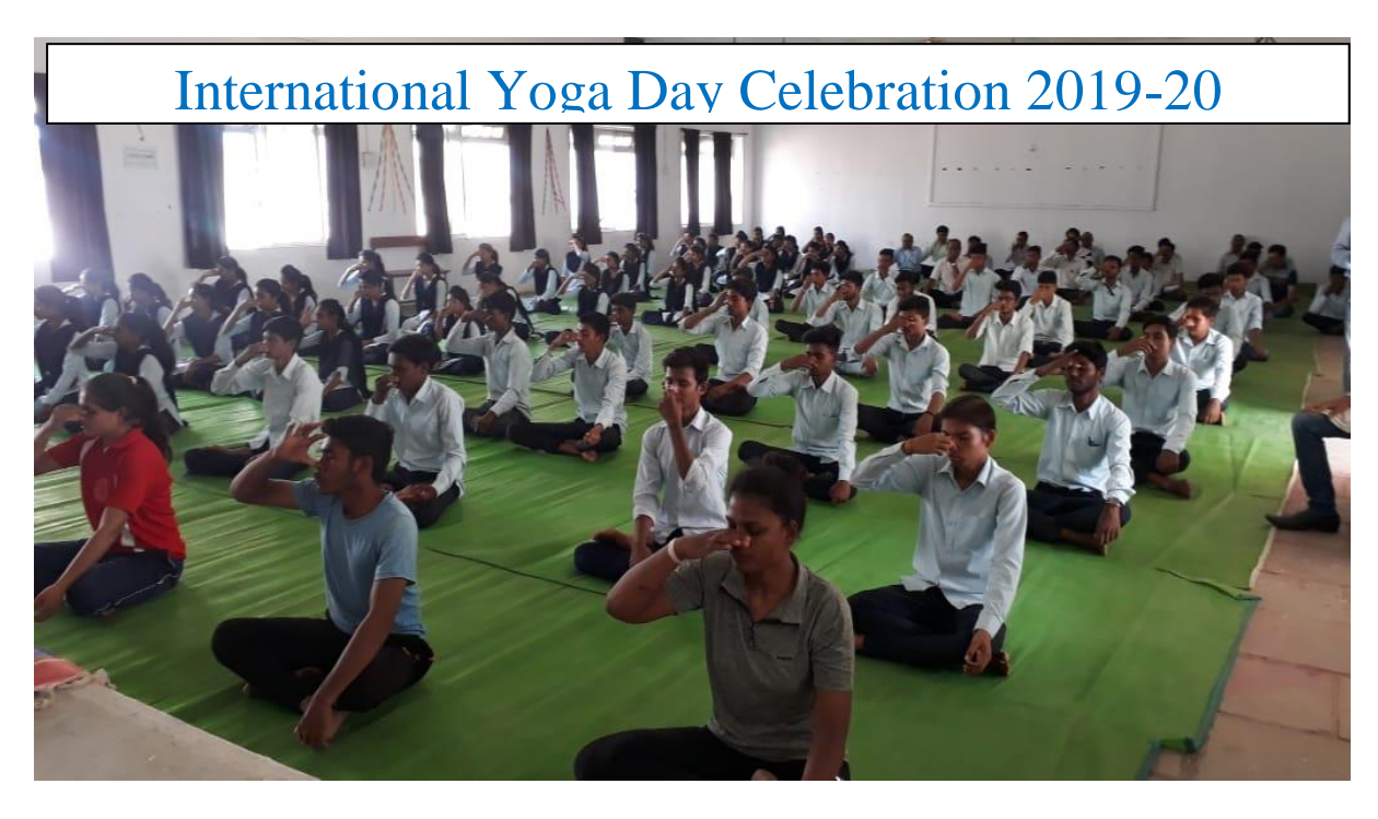
Figure 8International Yoga Day Celebration 2019-20