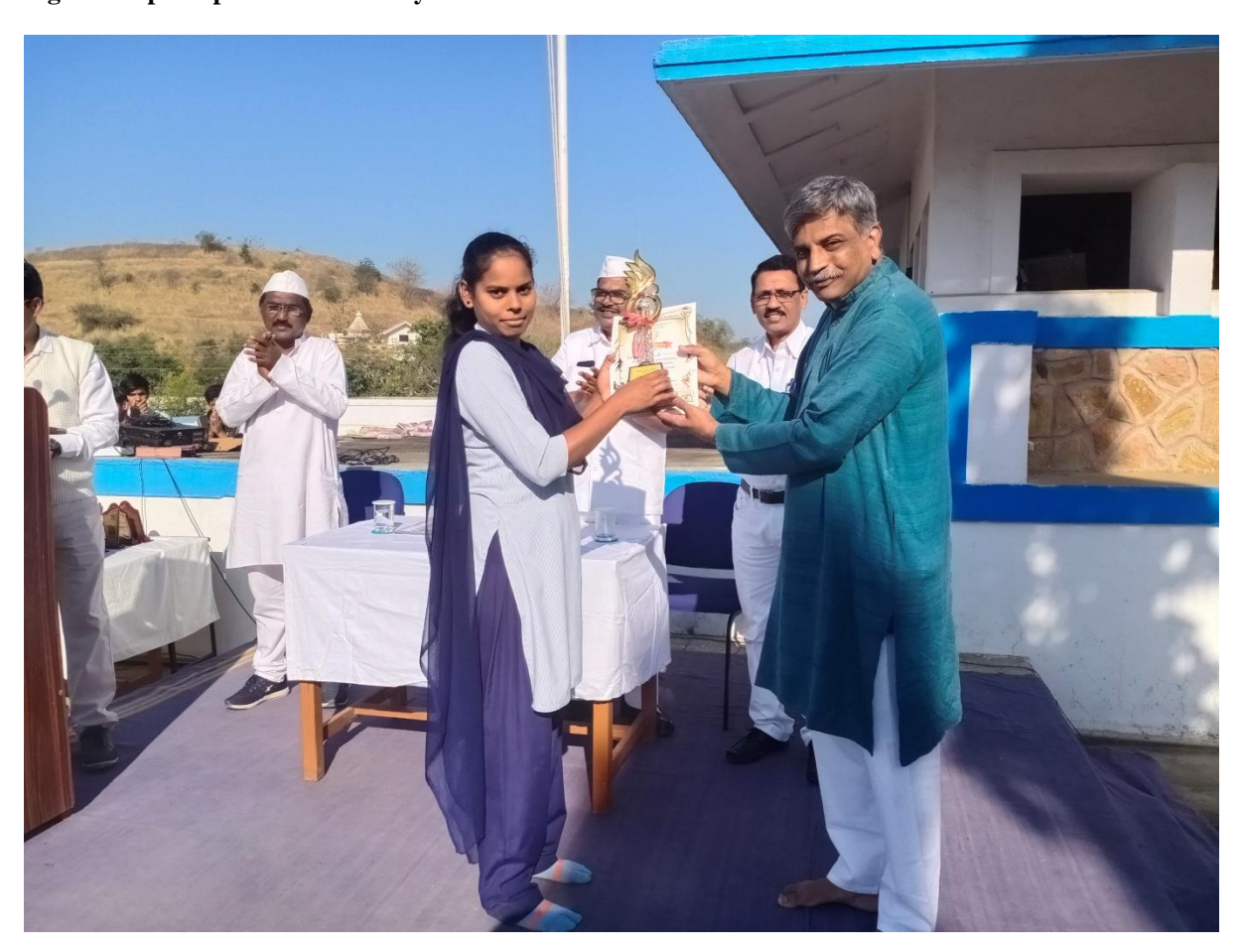
Figure 24Sports person felicitate by Chairman Shiksha Mandal 2019-20