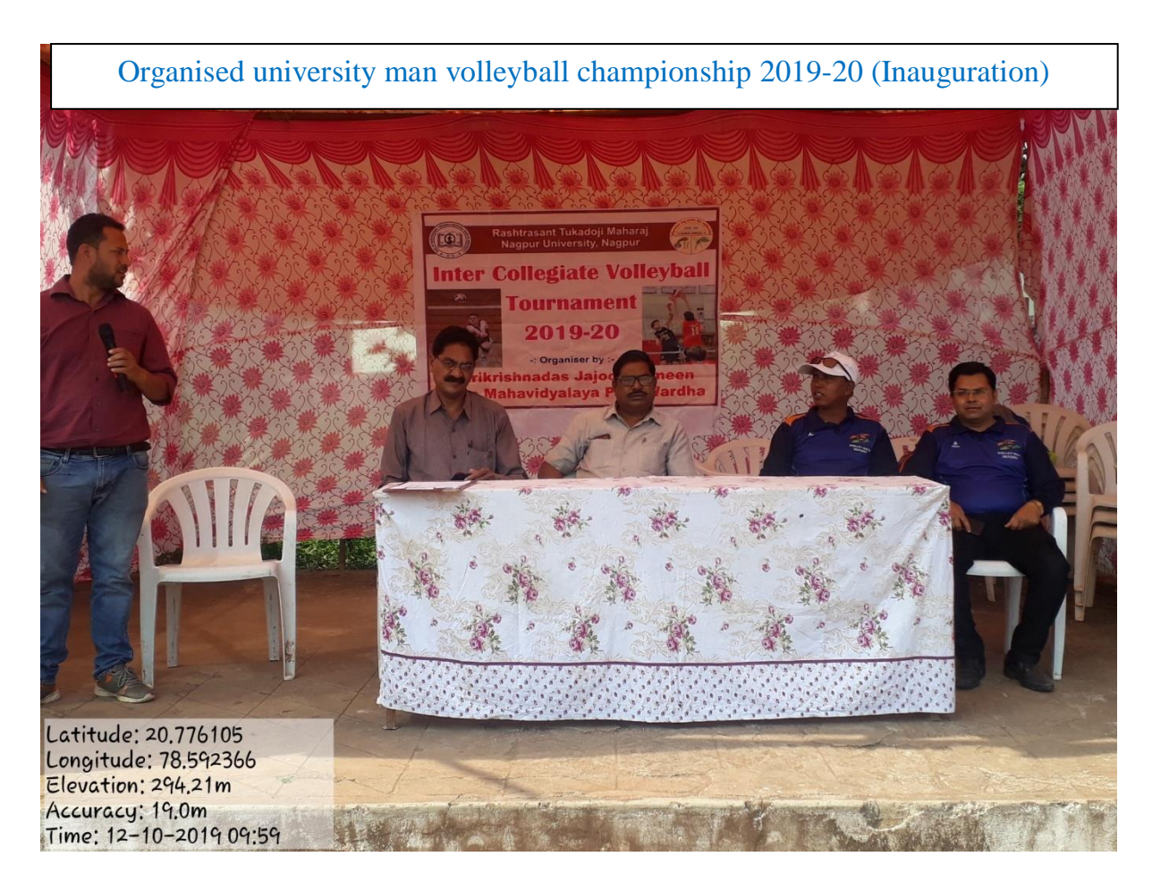
Figure 11Organised university man volleyball championship 2019-20 (Inauguration)

Organised university man volleyball championship 2019-20 (Teams in Action)