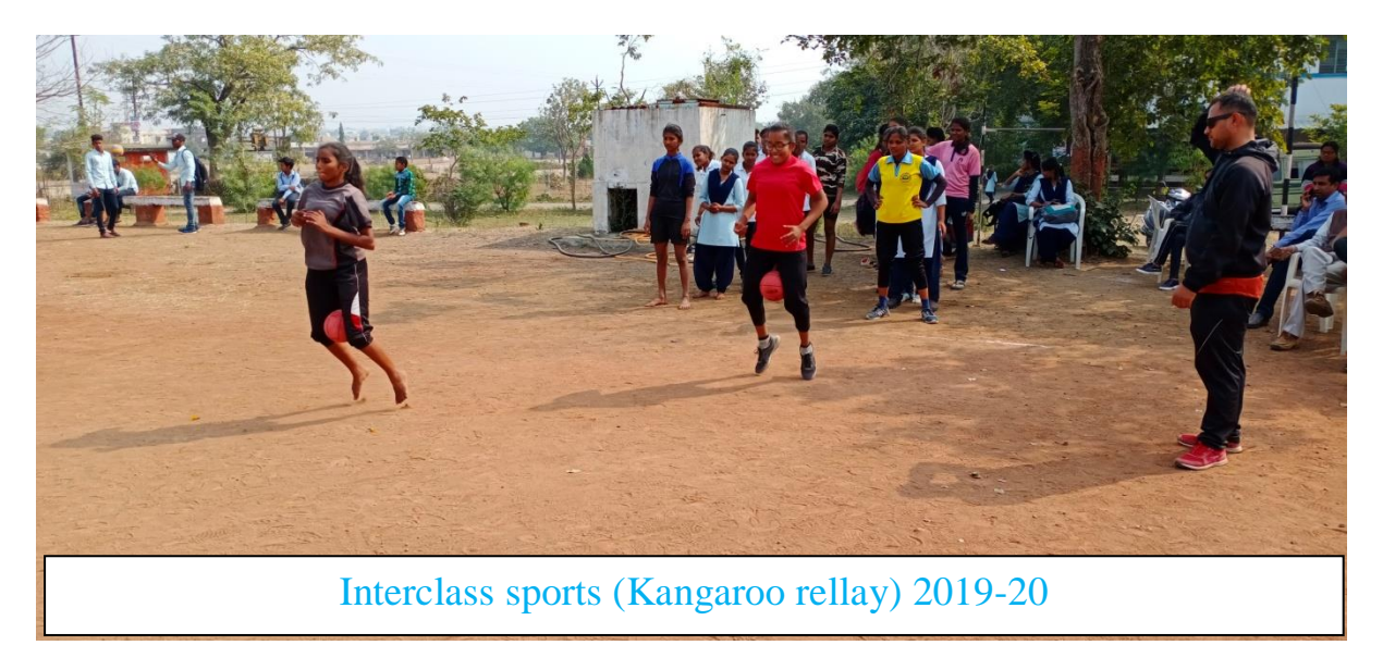
Figure 21Interclass sports (Kangaroo rellay) 2019-20