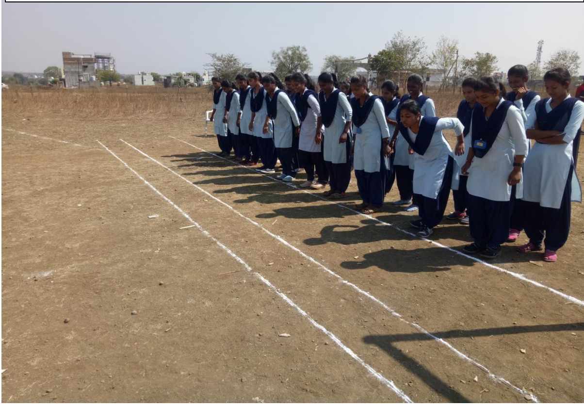
Figure 22Physical Fitness test 2019-20