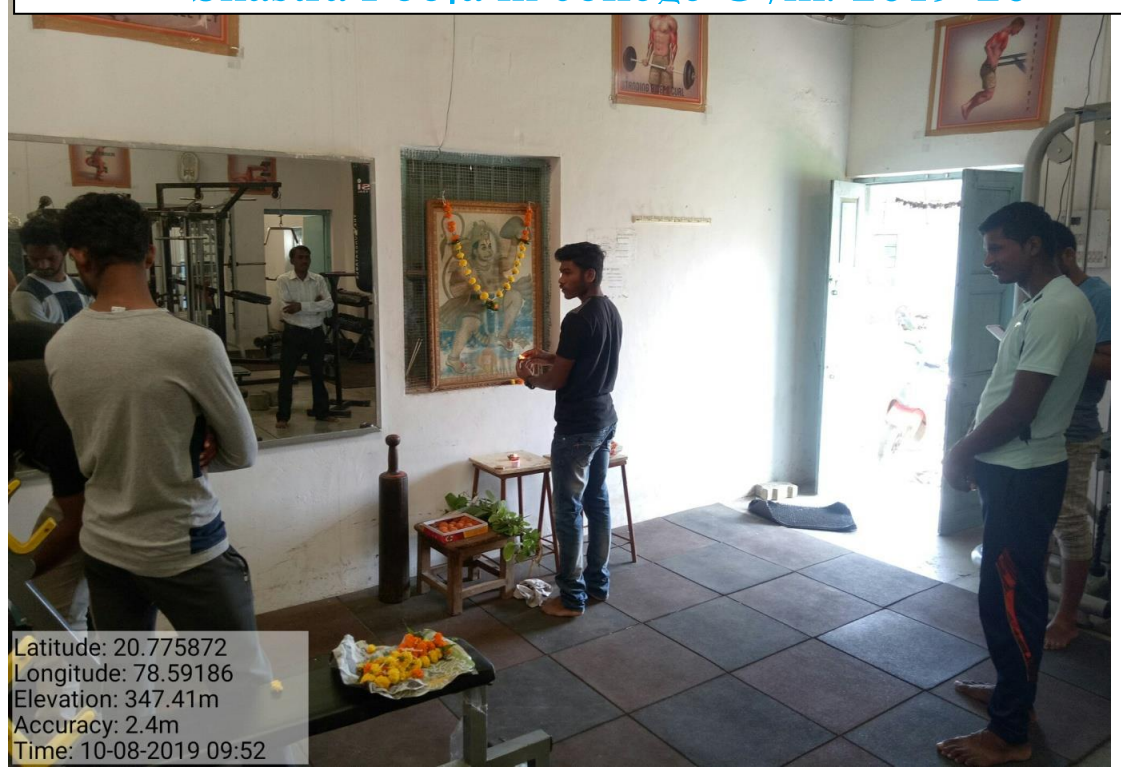
Figure 15Shastra Pooja in college Gym. 2019-20