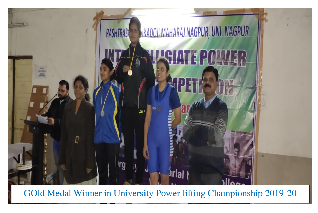
Figure 4GOld Medal Winner in University Power lifting Championship 2019-20