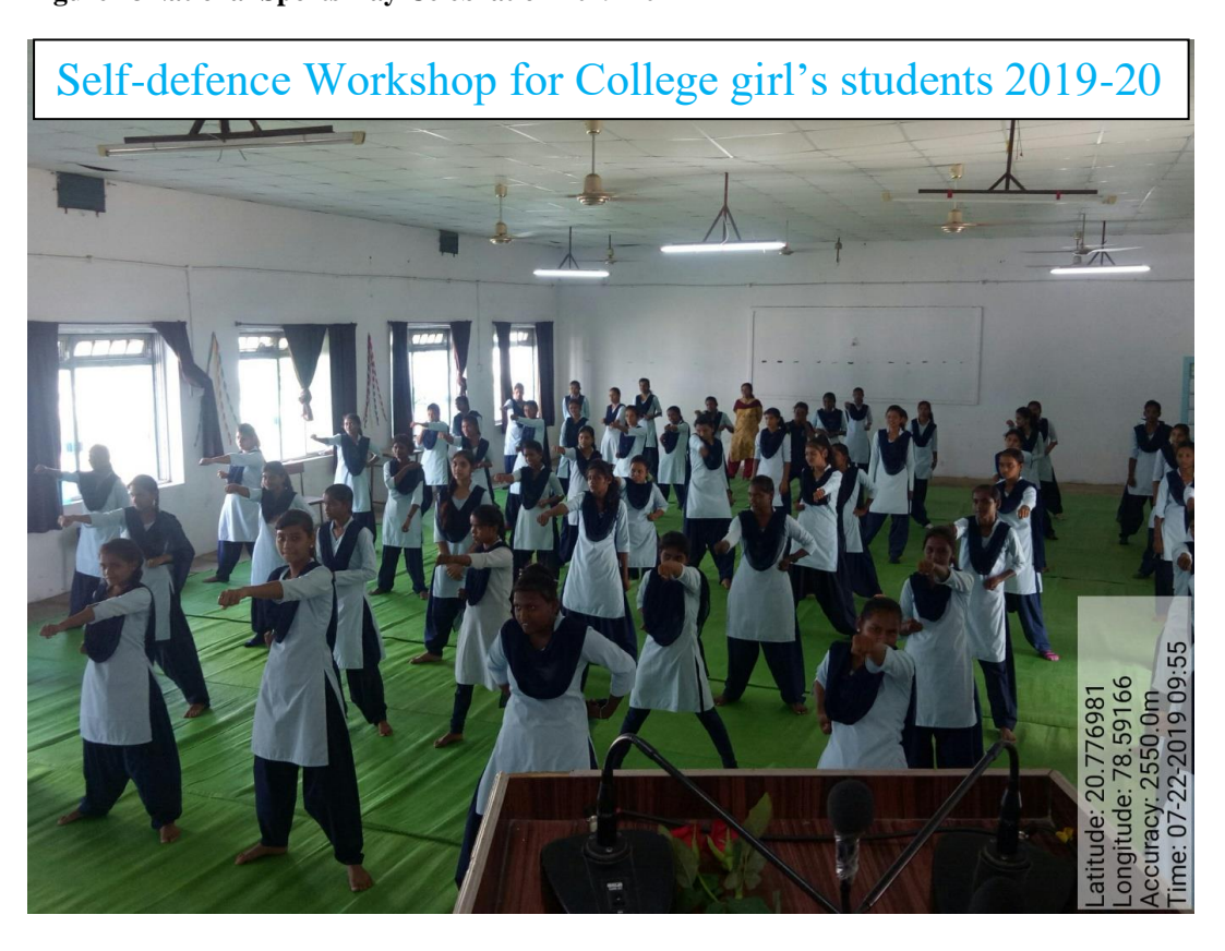
Figure 14Self-defence Workshop for College girl's students 2019-20