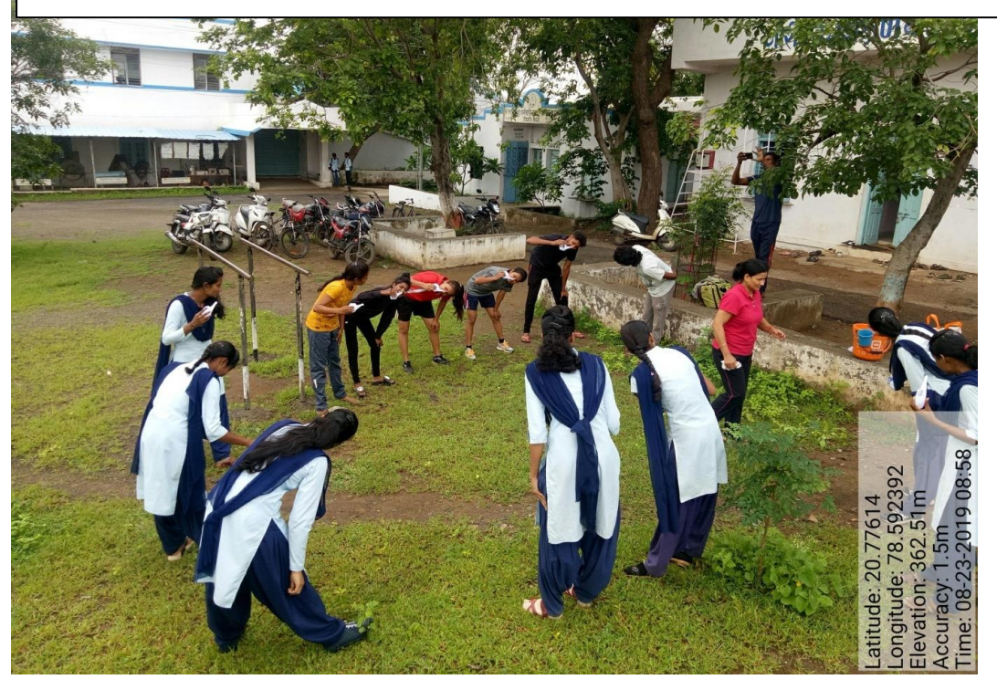
Figure 16Jal neti Practice by students (certificate course in Yoga) 2019-20