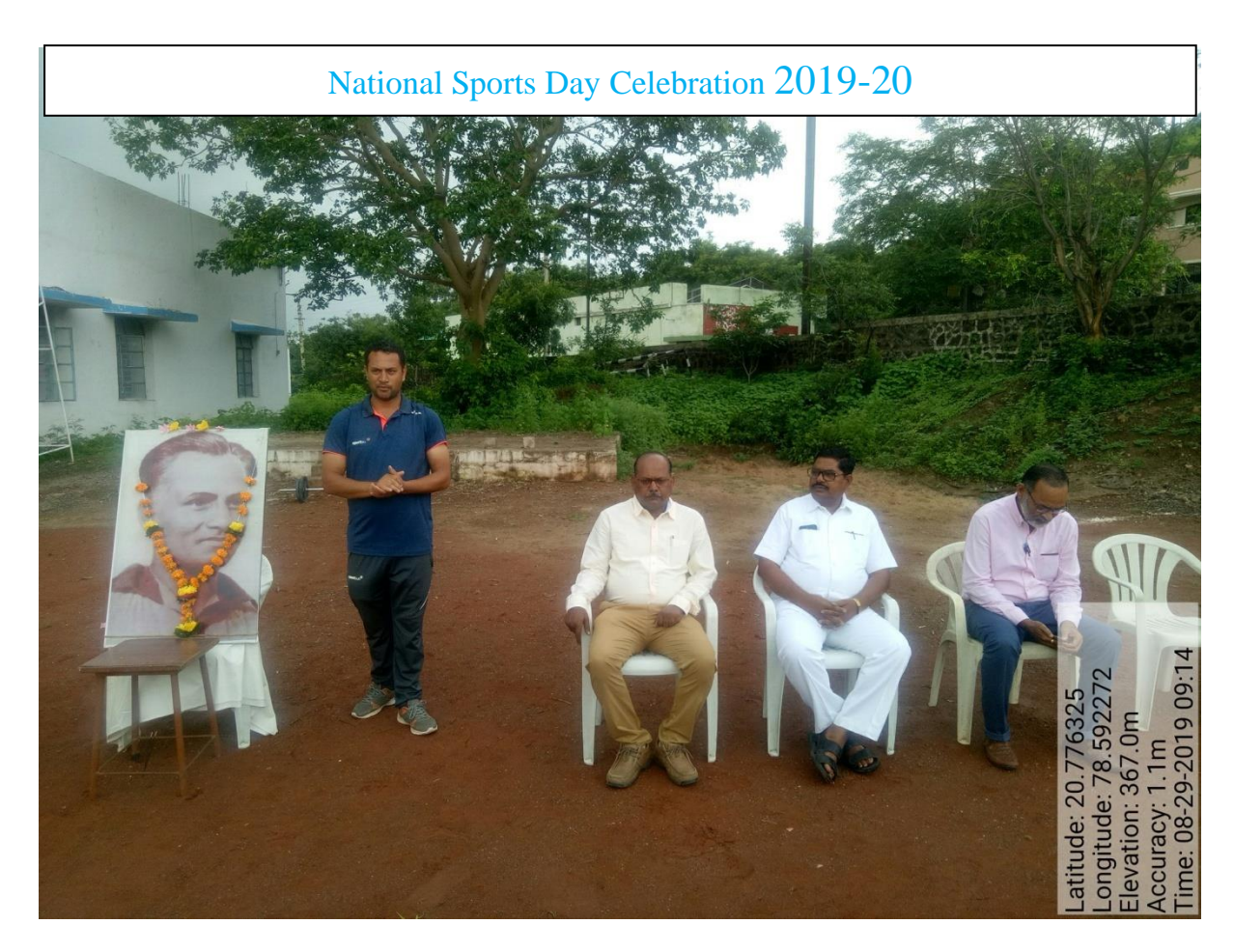
Figure 13National Sports Day Celebration 2019-20