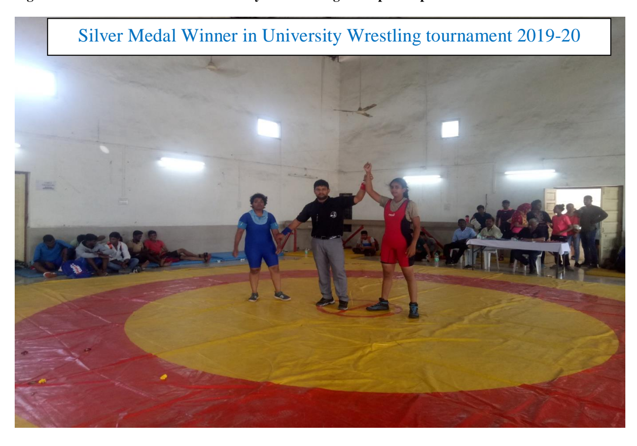
Figure 5Silver Medal Winner in University Wrestling tournament 2019-20