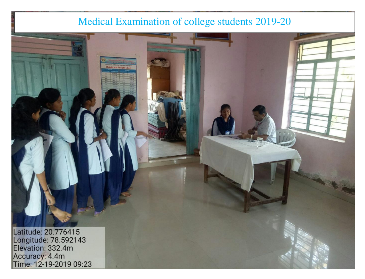
Figure 17Medical Examination of college students 2019-20