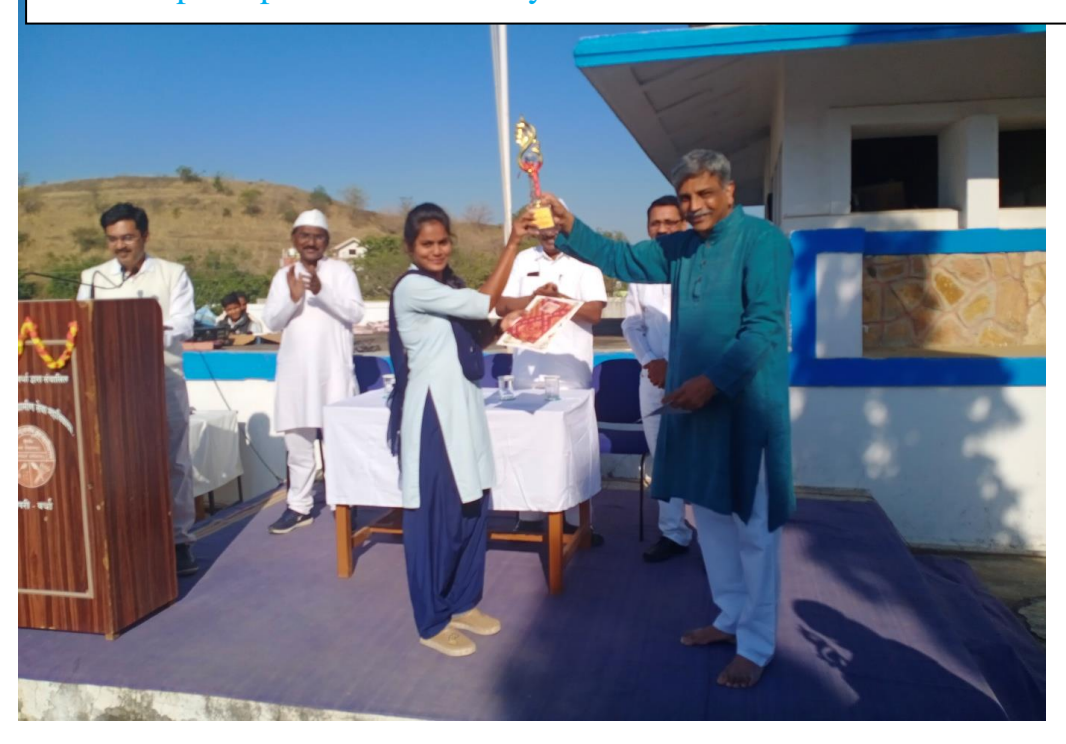
Figure 23Sports person felicitate by Chairman Shiksha Mandal 2019-20