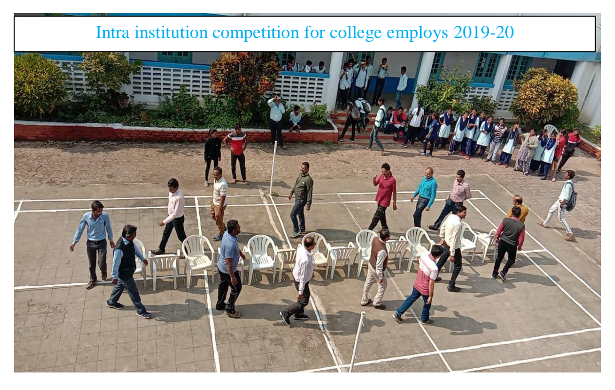
Figure 18Intra institution competition for college employs 2019-20