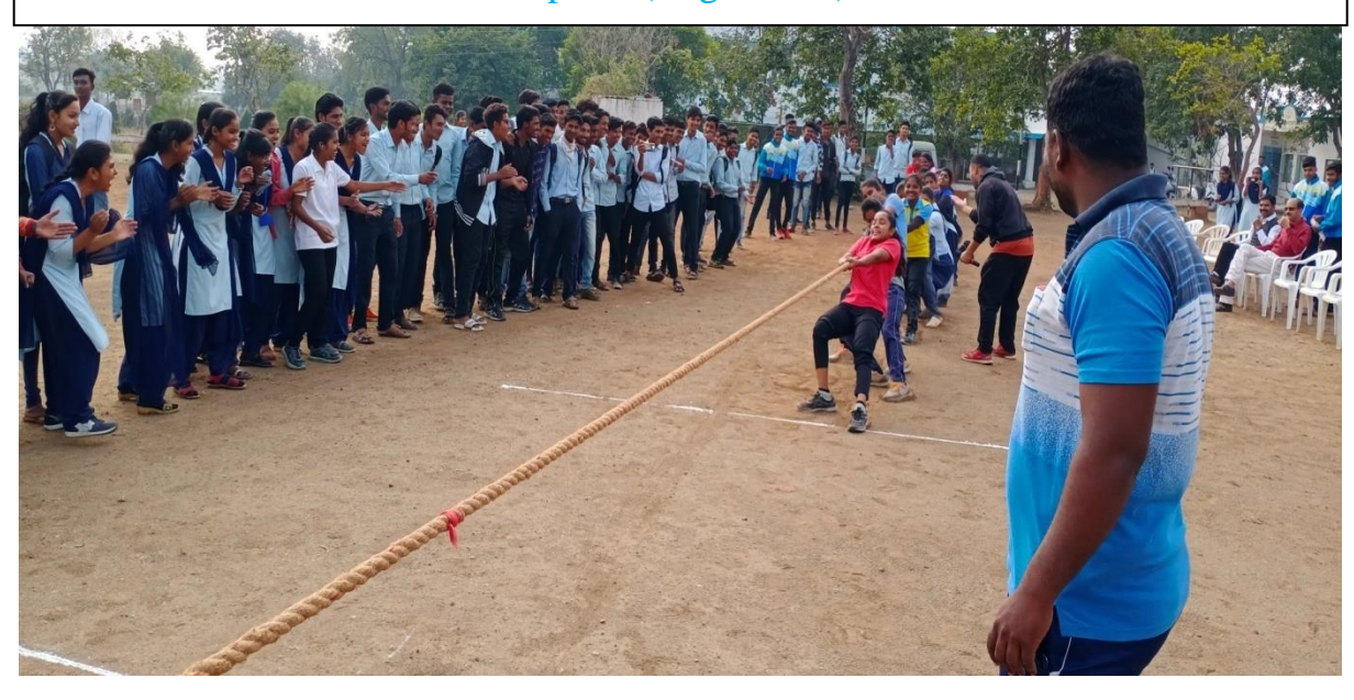
Figure 19Interclass sports (Tug of war) 2019-20