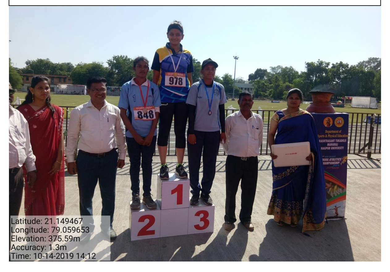
Figure 7Bronze Medal Winner in University Athletics championship 2019-20