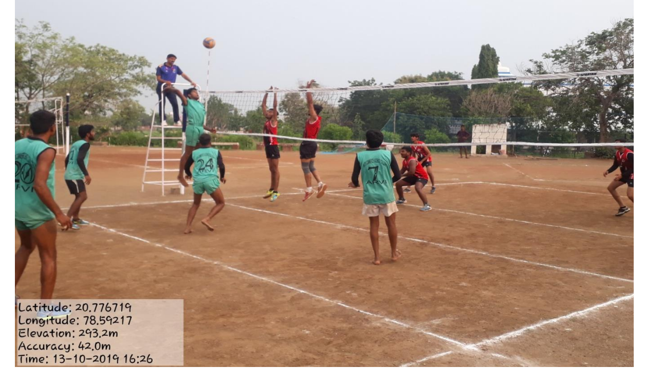
Figure 12Organised university man volleyball championship 2019-20 (Teams in Action)

Organised university man volleyball championship 2019-20 (Teams in Action)