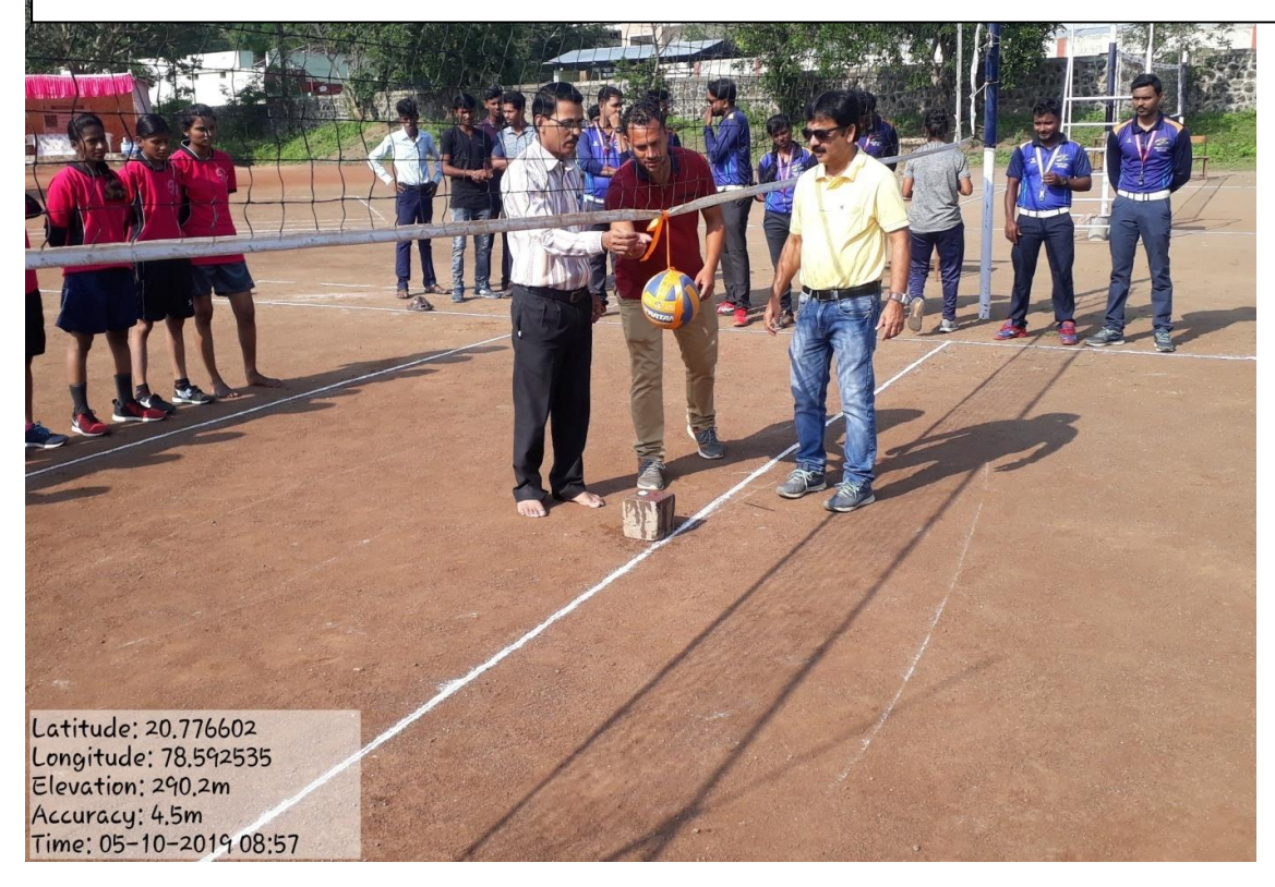
Figure 9Organised university woman volleyball championship 2019-20 (Inauguration)