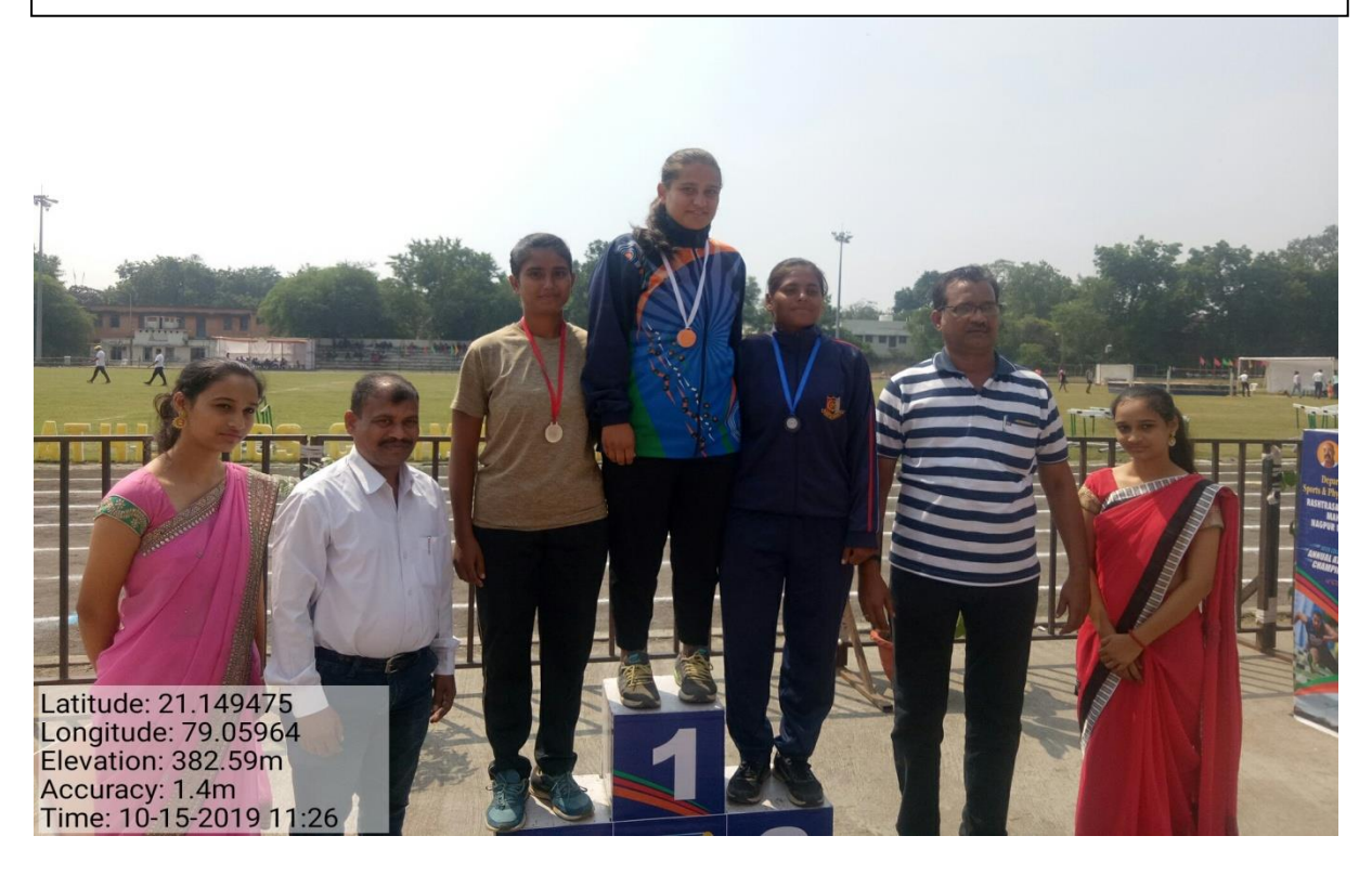
Figure 6Silver and Bronze Medal Winner in University Athletics championship 2019-20