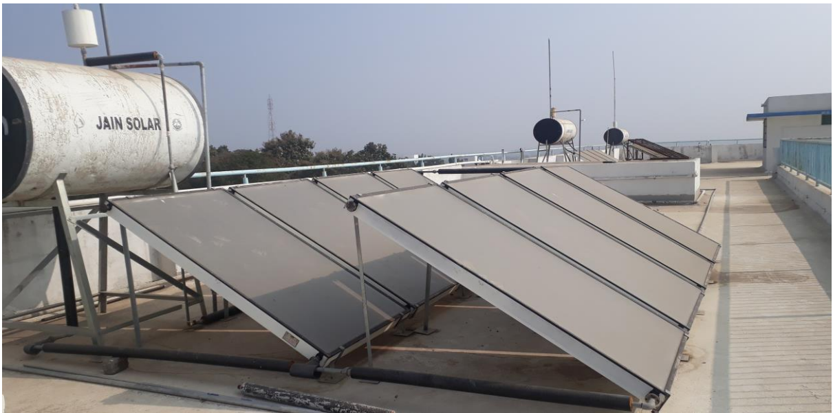
Solar water geysers at Girls Hostel

The girls hostel of our college has a bio-gas unit which is run on waste food left from the hostel mess.