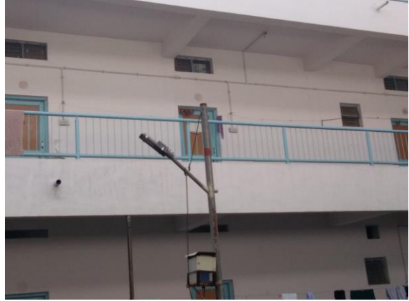
Solar lamps in the premises of Girls Hostel