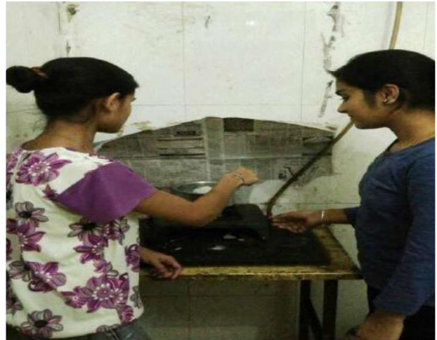
Bio-Gas unit at Girls hostel mess.