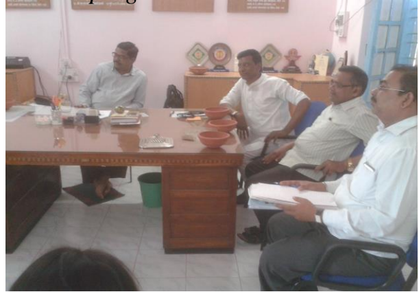
Drinking water Pots for birds