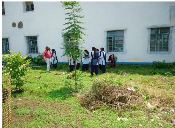
Cleanliness drive by Students