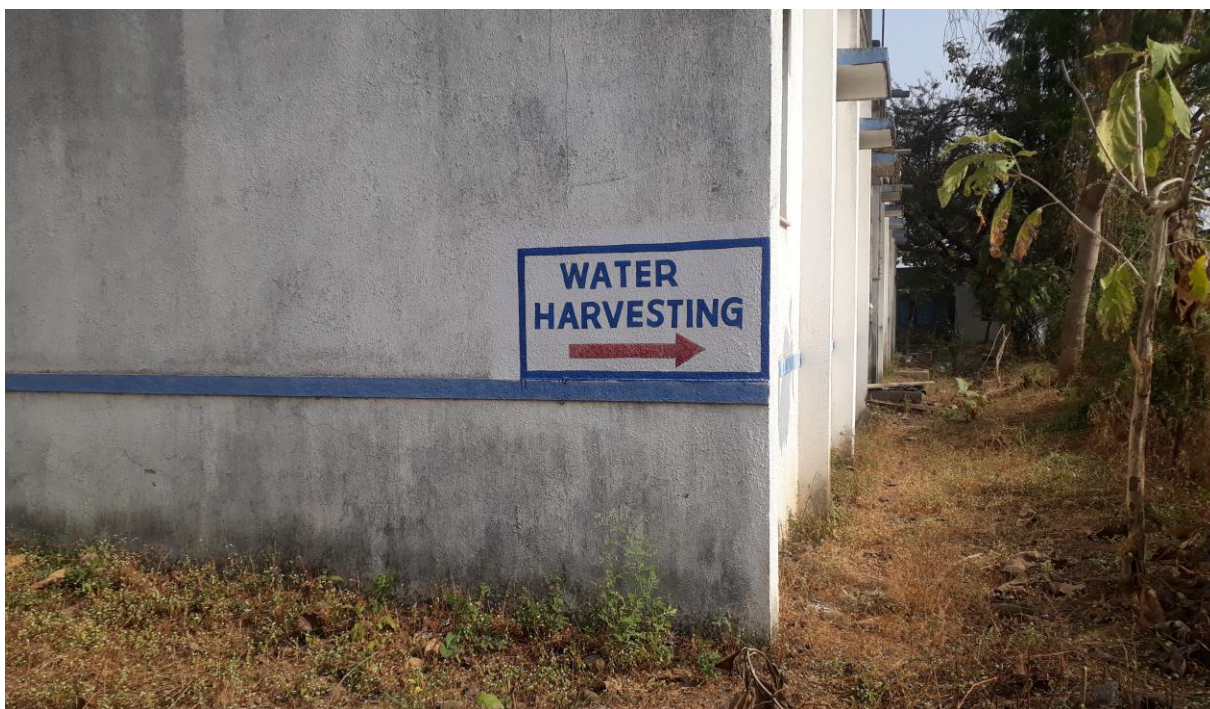
Water Harvesting Project

The roof water and run off water from the open ground should be improved and increased